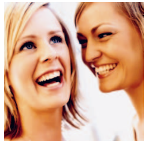
A friend is a friend forever.