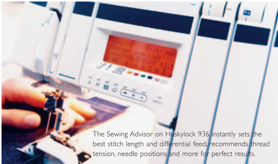
The Sewing Advisor on Huskylock 936 instantly sets the best stitch length and differential feed, recommends thread tension, needle positions and more for perfect results.